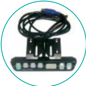
ill. 2: Programming unit